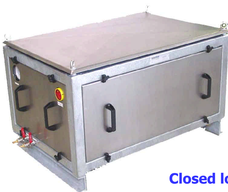
Closed loop recirculation chiller system CRC-1700 serie