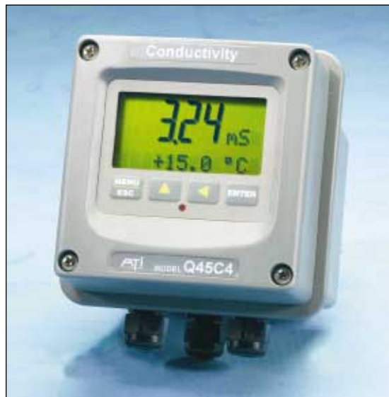
4E Conductivity Monitor

ATI's Q45C4 4-Electrode Conductivity Monitor is the answer for monitoring almost any water-based process. Drinking water, plating bath solutions, cooling water, process wash water, or virtually any other aqueous system can be monitored accurately and reliably. The unique drive/control scheme used in the 4-electrode system allows a single sensor configuration to be used in conductivity ranges from 0-200 \mu\text{S} to as high as 0-2,000 mS (0-2 S). The "auto-ranging" feature enables the monitor to display the actual conductivity value during "overshoot" conditions. For chemical mixing applications, a concentration display can be selected for a limited number of acids and bases. If your application