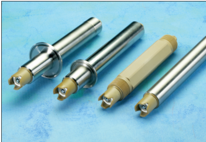
Sensor Mounting Configurations