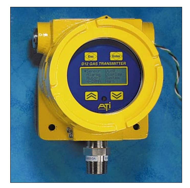
D12-IR Gas Transmitter

For plants operating with HART<sup>™</sup> protocol communications systems, the D12-IR can be supplied with this option. Our HART<sup>™</sup> output supports both 4-20 mA and constant current mode of operation.