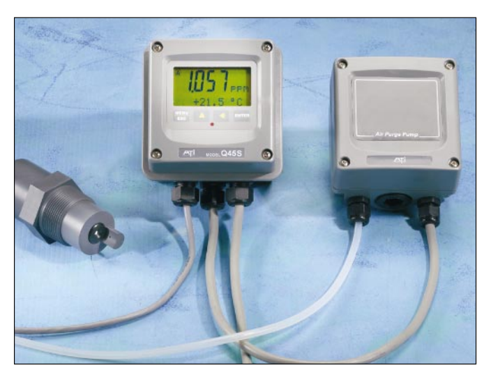
Q54S Monitor and Sensor

A special battery-powered version of the Q45S is available for use in temporary installations. This system runs on an internal 9 volt