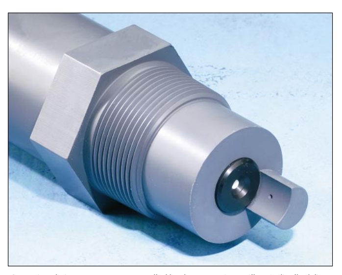
An optional air-purge system controlled by the transmitter will periodically deliver a blast of air across the critical sensor surfaces to remove water droplets.

battery and contains a data-logger for collecting information on existing air collection systems. A standard 9 volt battery will operate the unit for 4 days, while a 9 volt lithium battery will provide about 10 days of operation. Data is easily downloaded to a standard PC using software supplied with the unit.