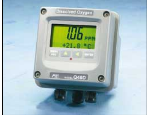
Dissolved Oxygen Monitor

When sensor maintenance is required, our cartridge-based sensor makes it fast and easy. Where other manufacturers make you throw away the cartridge, we've made our cartridge field-repairable. We also include enough replacement parts to rebuild your cartridge ten times. When you consider the average cost of a competitor's cartridge at $125, ATI can save you thousands of dollars in maintenance costs.