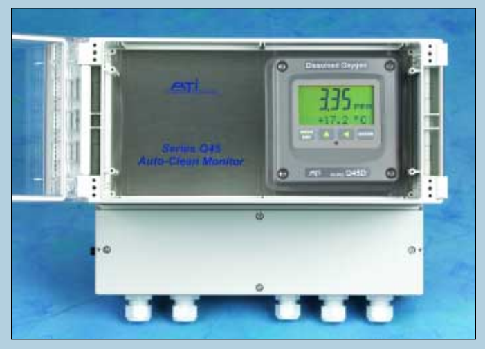
The Auto-Clean DO Monitor

Enter ATI's Auto-Clean D.O. Monitor, the first D.O. monitor to clean itself with air. Biological growth and other contaminants are literally blasted from the Teflon membrane. The result: reduced maintenance, better performance, and more accurate D.O. monitoring.