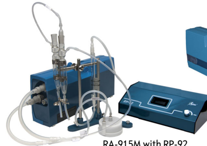
RA-915M with RP-92