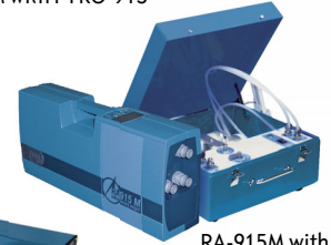
RA-915M with RP-91NG