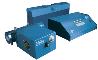
RA-915M with PYRO-915+